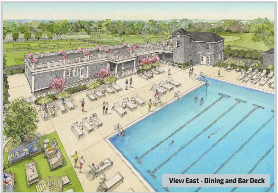
View East - Dining and Bar Deck