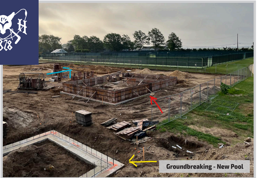
Groundbreaking - New Pool